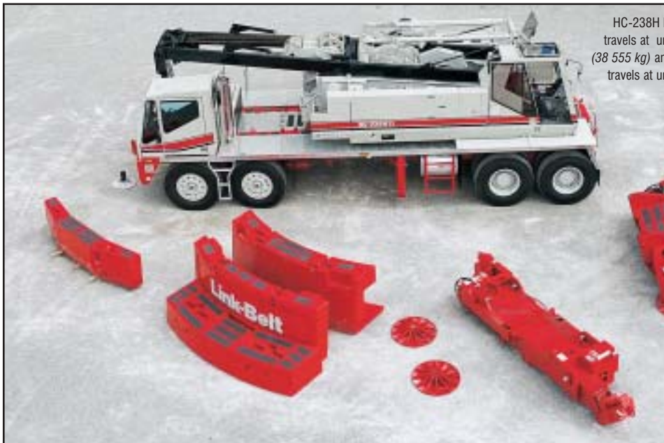
HC-238H II base machine travels at under 85,000 lbs (38 555 kg) and the HC-248H travels at under 93,000 lbs (42 185 kg).