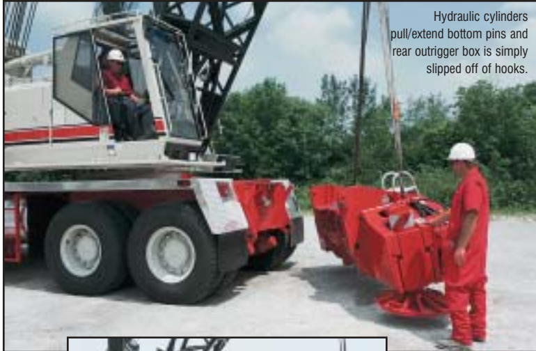
Hydraulic cylinders pull/extend bottom pins and rear outrigger box is simply slipped off of hooks.

The HC-238H II and HC-248H are designed to be self-erecting and self-stripping. The optional 10' extender with lifting sheaves is used to assemble/disassemble, or the live mast can be used as a short boom for loading and handling counterweight, outrigger boxes and boom sections — eliminating the need for a helper crane.