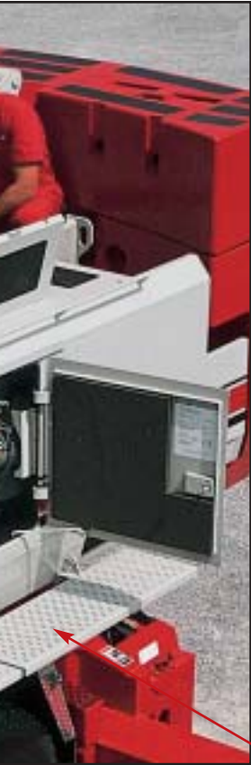
Left-hand catwalks optional

Independent hydraulic boom hoist is driven by a variable displacement axial piston motor through a gear reduction system. This system features infinitely variable boom hoist speed, automatic boom hoist brake and a limiting device that restricts hoisting boom beyond recommended minimum radius.