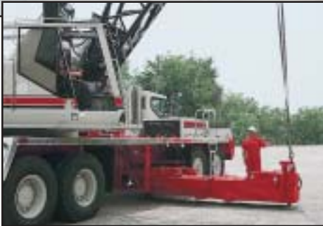
The front outrigger box can be easily removed for transport in locations with severe weight restrictions.