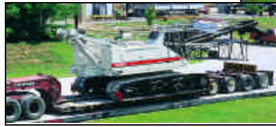
Load #1 - under 90,000 lbs (40 823 kg)

The LS-138H II easily transports in three loads, each less than 12' (3.66 m) in overall width. With its lightweight modular components, no other crane is faster, easier or more efficient to transport.