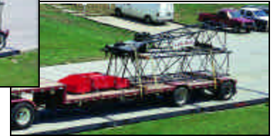
Load #3 - under 33,000 lbs (14 968 kg)