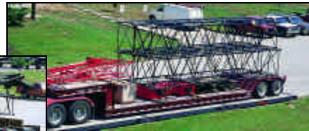
Load #2 - under 36,000 lbs (16 329 kg)